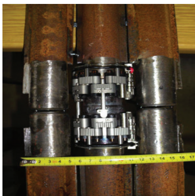
Micro Phased Array